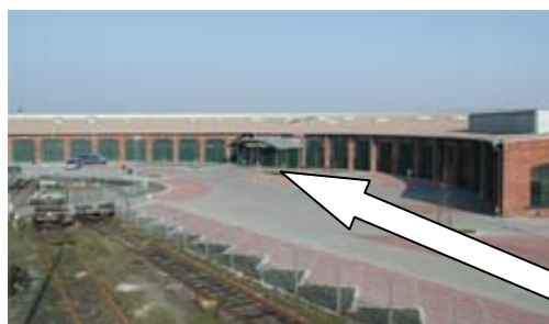
main entrance of the 'Ringlokschuppen'